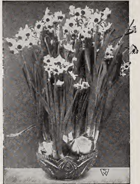
Chinese Sacred Lily

L. speciosum album . White. 9- to 11-inch bulbs (50 per case).....$25 00 L. speciosum magnificum . Pink. 9- to 11-inch bulbs (50 per case).... 25 00